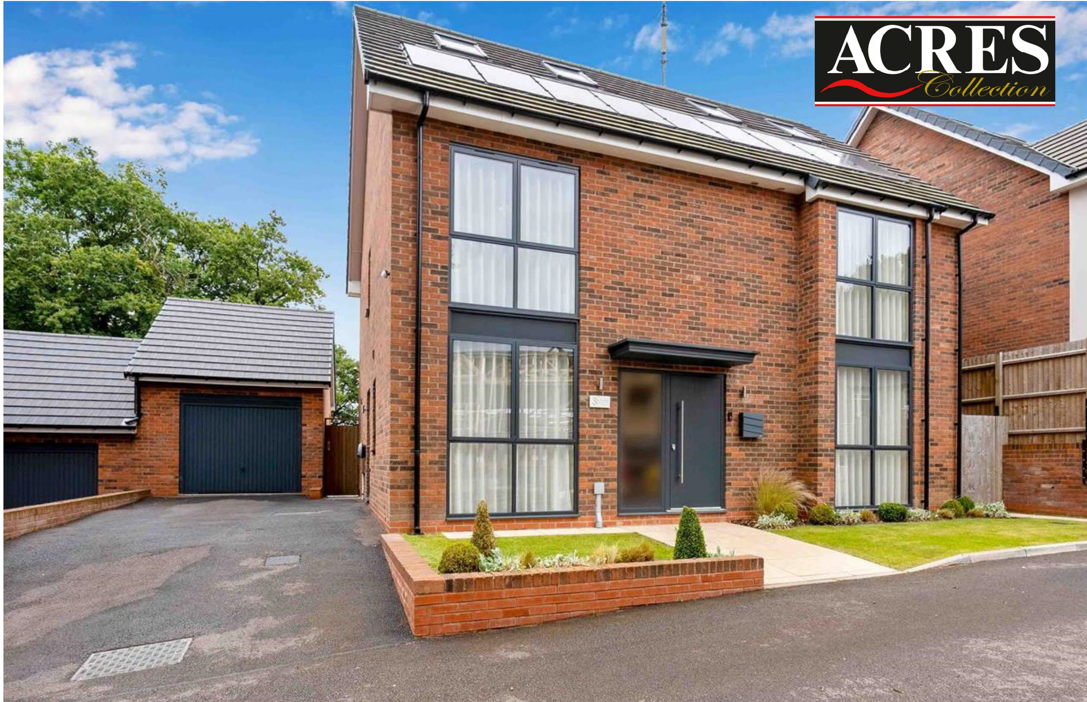
HEATHFIELD HOUSE, 3 OAK VIEW RISE, FOUR OAKS, B75 5JL